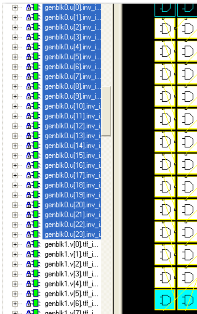
Figure 2 • Ring Oscillator Inverter Loop Placement

Figure 2 shows the ring oscillator inverter loop placement.